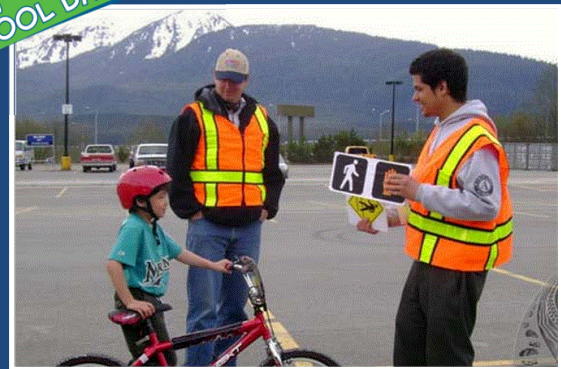
Bike to School Day, May 9, 2012

To participate in the Community Safe Routes to School survey or for more information visit www.islandtrails.org .